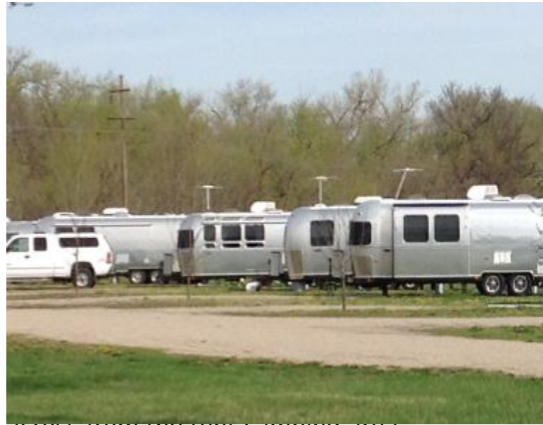
across from the tent camping area.

Envelopes are available at the campsite to deposit camp fees in the drop box at that location. Reservations for sites 1-8 must be made online here or by calling (402)372-2466. Camping fees are $15.00 per night. Sites include 50 amp electric service and water hookup. Off-site sewer dump is available with a $2.00 dump fee. The sewer dump station is located near the swimming pool at the south side of the park.